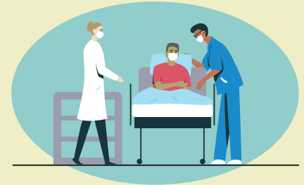
Health care personnel with direct patient contact.

PERSONNEL INCLUDE BUT ARE NOT LIMITED TO: