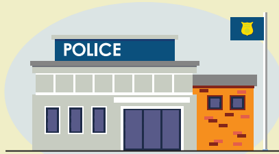
Sworn law enforcement officers age 50 & older.