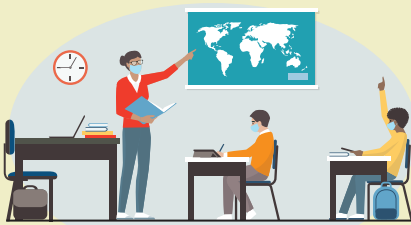
K-12 school employees age 50 & older