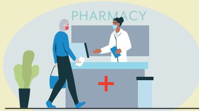
People age 60 & older.