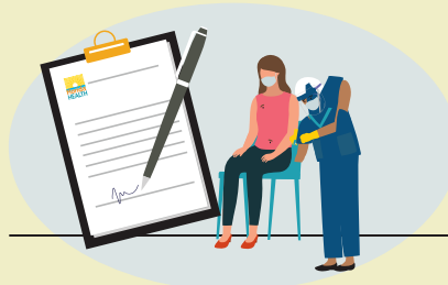
People determined by their physicians to be extremely vulnerable to COVID-19.*