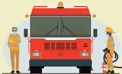
Firefighters age 50 & older.